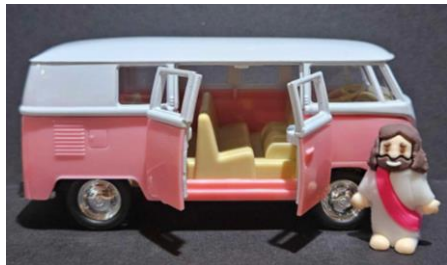
Sharing a "Little Jesus"