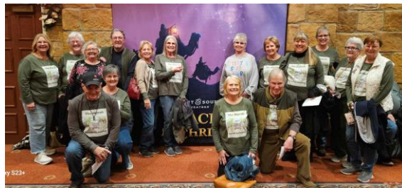
Wearing our new tee's in Branson