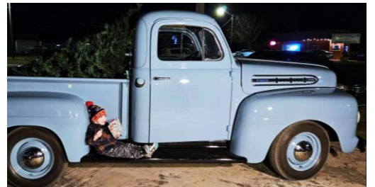
Sharing Kodak moments at the Langley Parade