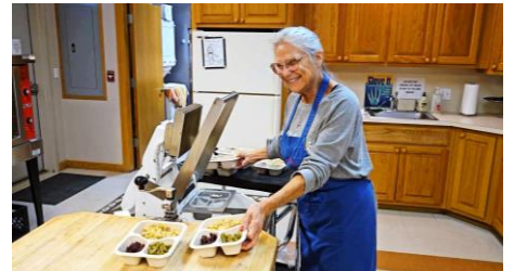
Meals on Wheels celebrates 20 years of ministry!