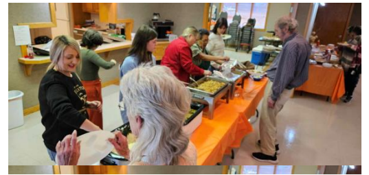
Delicious Thanksgiving meal served to our community